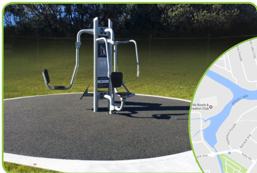
Outdoor exercise equipment